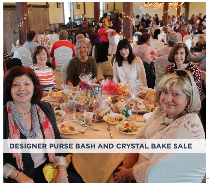
DESIGNER PURSE BASH AND CRYSTAL BAKE SALE