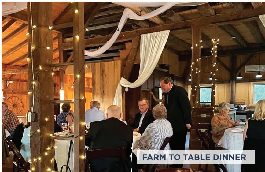
FARM TO TABLE DINNER