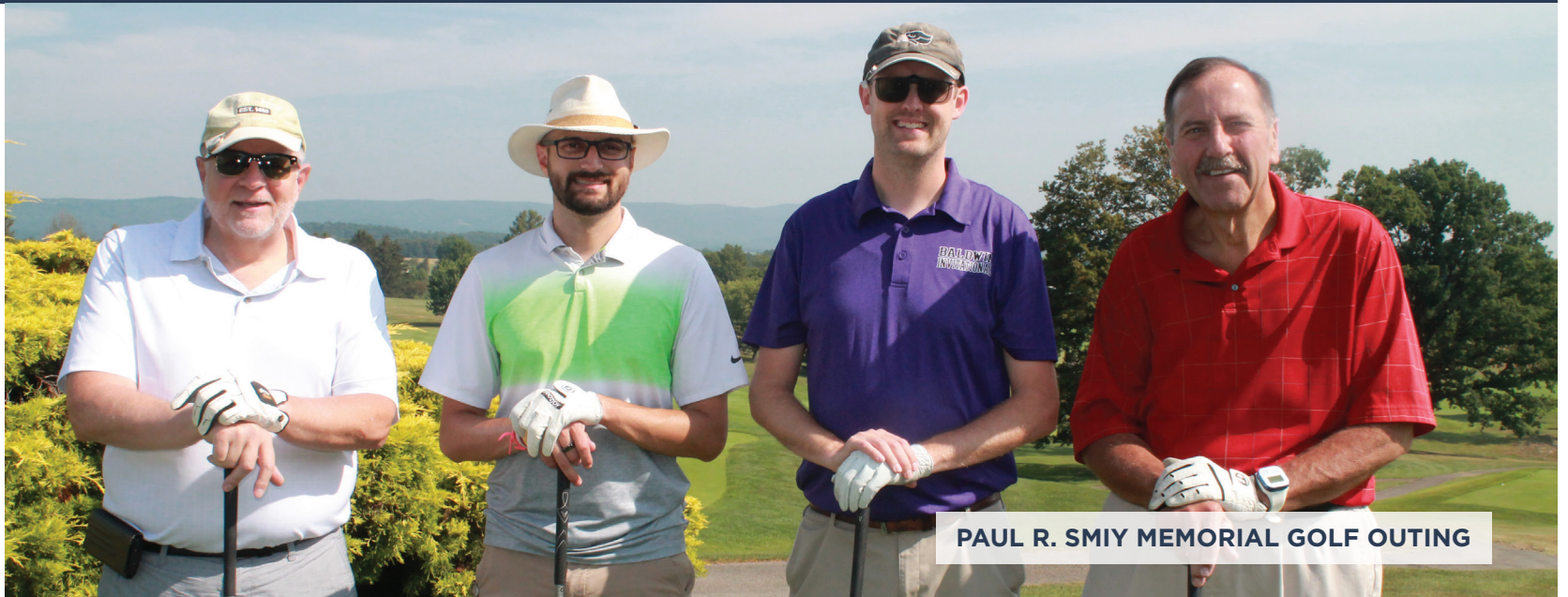
PAUL R. SMY MEMORIAL GOLF OUTING